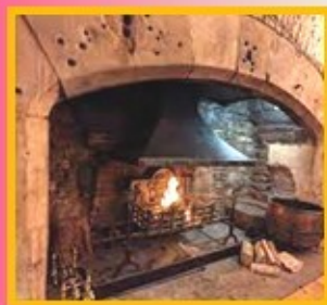
14th Century Fireplace

to celebrate fifty and forty years, respectively, with their fellow members of the Grantham Town Handbell Ringers. On a Wednesday afternoon in February guests and family, gathered at Grantham's Angel and Royal Hotel where they enjoyed a sumptuous afternoon tea.