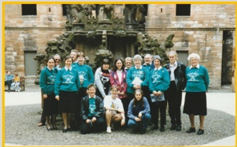
The Saint Wulfram's Handbell Ringers on their German visit in 1987