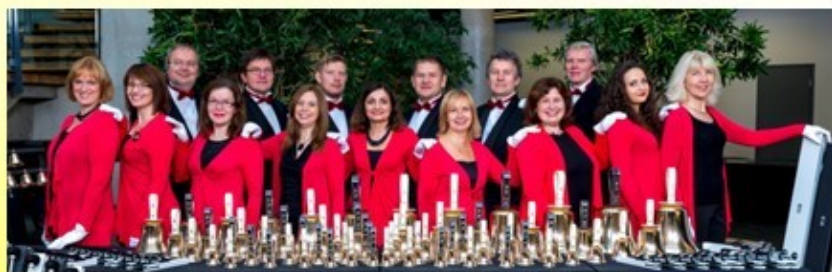
Campinelli Handbell Ensemble