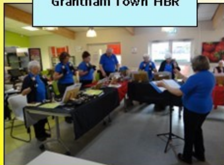
Grantham Town HBR

During the day Grantham Town and Stanwick played a variety of tunes on their bells and handchimes. These were much appreciated and applauded by the audience.