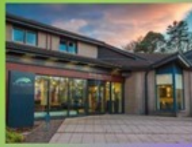
STIRLING COURT HOTEL

The Scottish Region is looking forward to hosting the UK National Rally 2023 at the Stirling Court Hotel, Stirling.