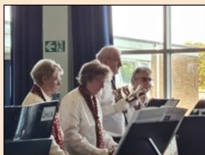
Stanwick Handbell Ringers