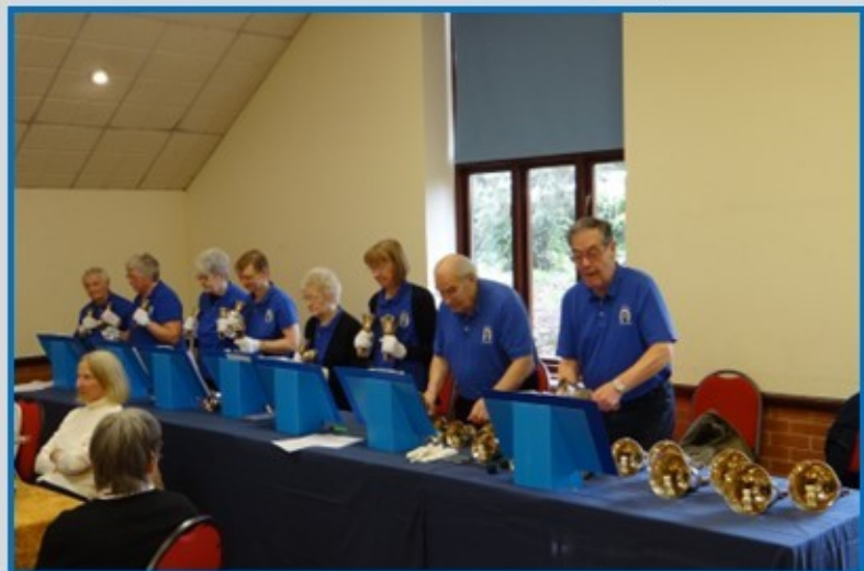
Cottesmore Handbell Ringers at Raunds Rally 2019