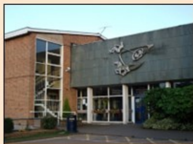
Upper School Kenilworth

It was now the turn of individual teams to participate in a round of rally ringing. There were many teams of different sizes ranging from a full five octaves to Stanwick's twelve bell ensemble. It was lovely to hear all the teams play.