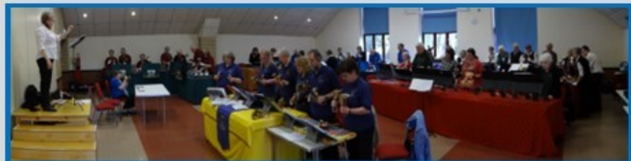
Massed Ringing at Raunds Rally - "Be Still My Soul"