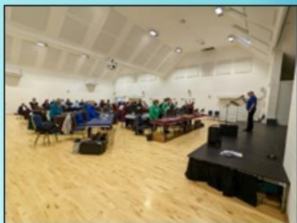
Great Denham Community Hall