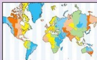
World Time Zones